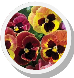
Pansy Mammoth Sangria Punch