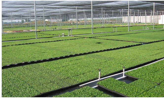
Outdoor pansy growing under 50% saran curtain