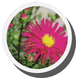
Aster Winston Churchill