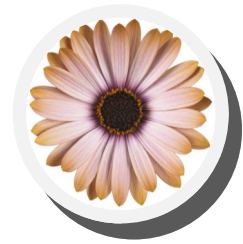
Osteospermum Margarita Sunset