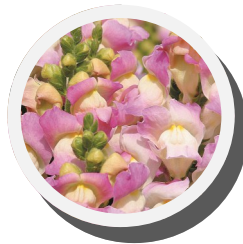
Snapdragon Montego Blush