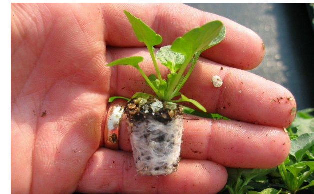
Pansy Plug from a 288 tray

Discounted grower trucking services are available for large orders. Orders can be pooled together in an area for truck shipping. A rack exchange program is also available for orders of 100 trays or more.