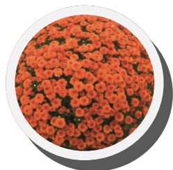
Garden Mum Ashley Dark Orange