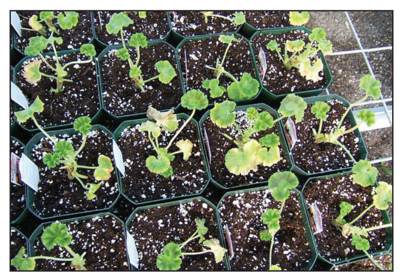
10 days from receiving.