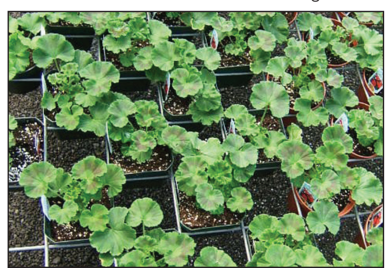
32 days from receiving.