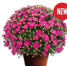
Debbie™ Hot Pink