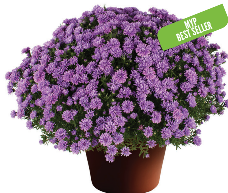
Don't Forget about ASTERS! Henry™ I Blue Double