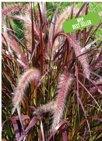
Pennisetum Rubrum Mega50 Tray