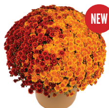
Beverly™ Copper Penny Mix (Beverly™ Bronze, Dark Bronze, and Orange)

Continuous innovation for garden mums, combos, and asters!