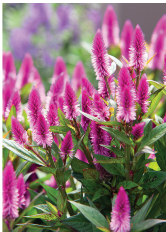
Celosia Intenz Split 51 Tray

Ideal for combinations! Use as an accent plant or focal point in your mum combo pots.