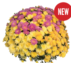
Confetti Garden Virgo (Ditto Pink, Lemon, and Honey)