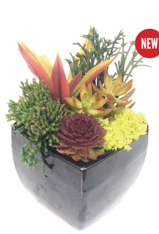
Fall Bonfire Mix

Available in a 72 Cell Tray and features SIX different varieties (12 each). Grown as a 72/Sold as a 72.