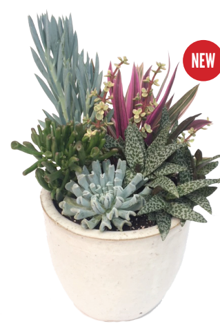
Frosty Night Mix